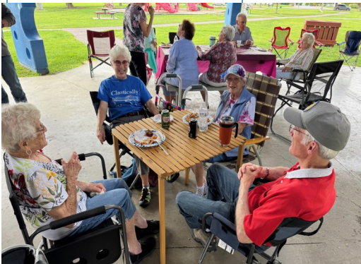
Church Picnic 8.6.25

Thank you to everyone who assisted, organized, and participated. It was a great event!